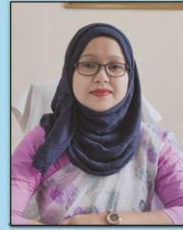
Principal HAMM Nursing School