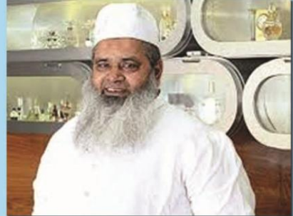
Joint Managing Trustee