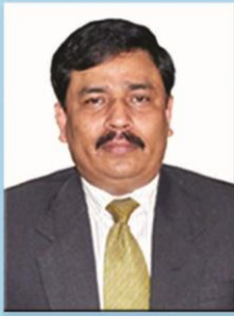
Chief Medical Director HAMM Public Trust