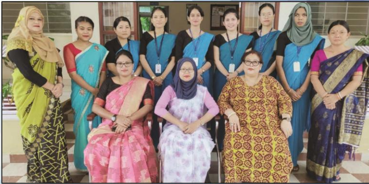
Teaching and Non Teaching Staff