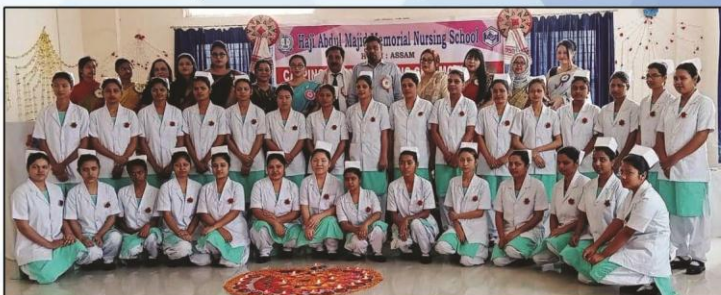
3 rd year students (11 th Batch)