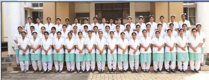
2 nd year students (12 th Batch)