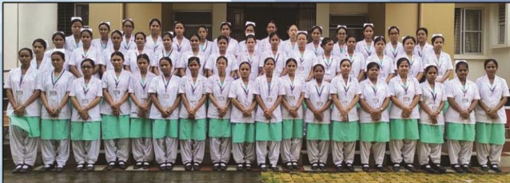
1 st year students (13 th Batch)